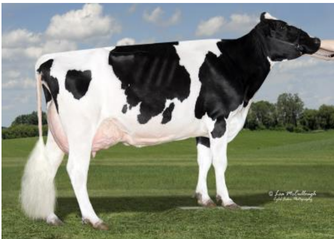
MGD: OCD Planet Danica-ET