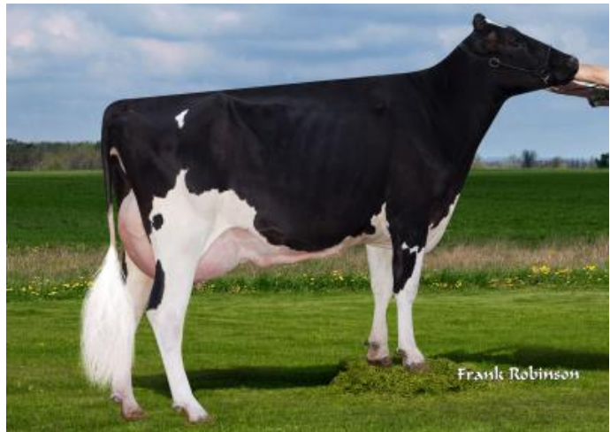
Daughter: Richmond-FD Dante Deanie

Sire: De-Su Bkm Mccutchen 1174-ET TV TL TY TD Dam: Miss Ocd Robst Delicious-ET VG-87 GMD DOM 02-05 2x 365d 33780m 3.3 1121f 3.1 1047p MGS: Roylane Socra Robust-ET TR TV TL TD MGD: OCD Planet Danica-ET EX-93 DOM 03-01 3x 365d 39240m 3.5 1384f 3.0 1166p MGGS: Ensenada Taboo Planet-ET TR TV TL TY TD EX-90 MGGD: Miss Elegant Delight-ET VG-88 DOM 02-02 3x 305d 27850m 3.4 958f 2.9 803p