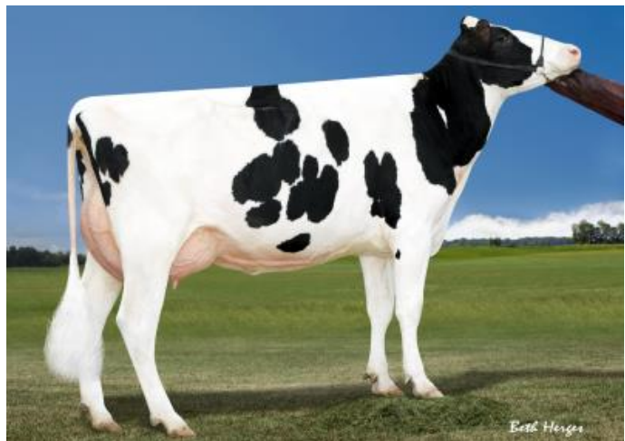
Dam: Miss Ocd Robst Delicious-ET