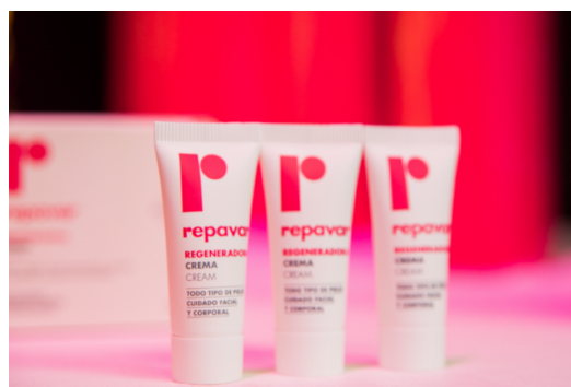
Repavar Products are unveiled at the launch event.