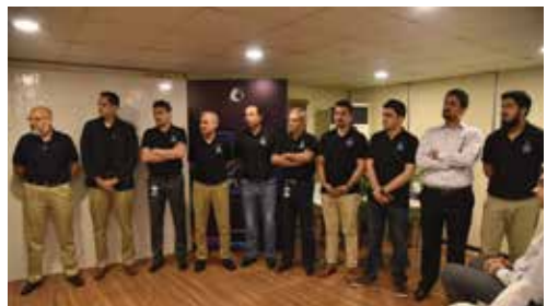
EXPLORE Champions led the Q&A session after the event