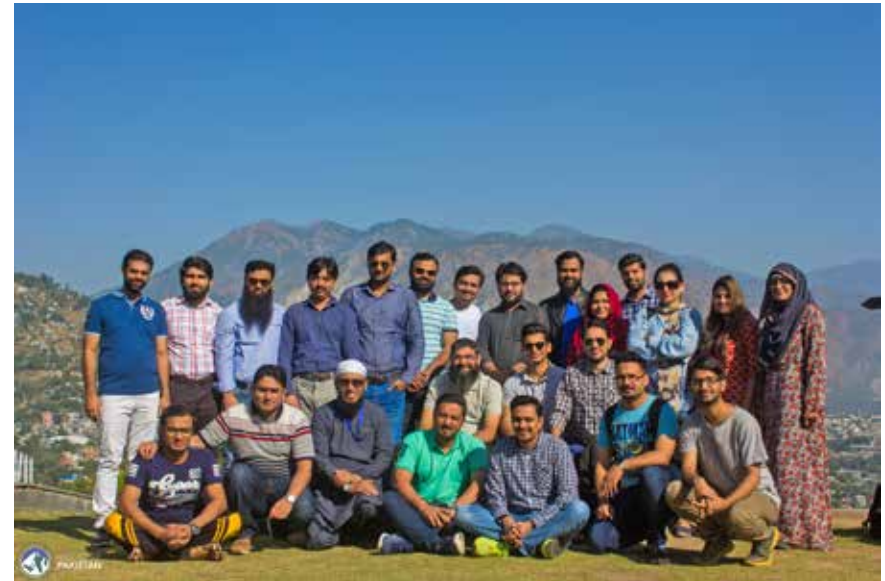
Group Photo at PC Hotel, Muzaffarabad