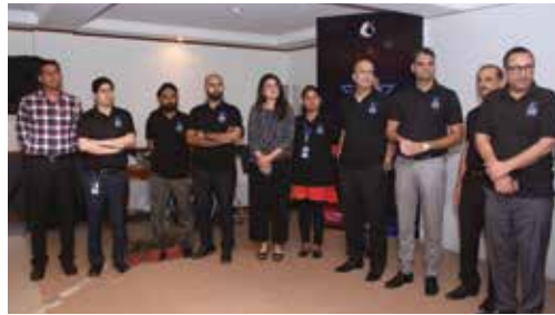
The EXPLORE catalysts and team members played an important role in making the HO launch a success