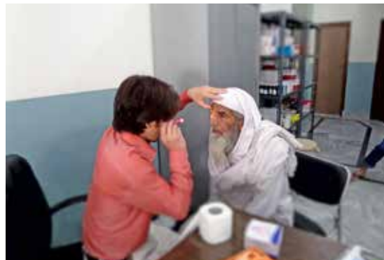
Since its soft launch, the clinic has catered to over 4,560 OPD cases in the community