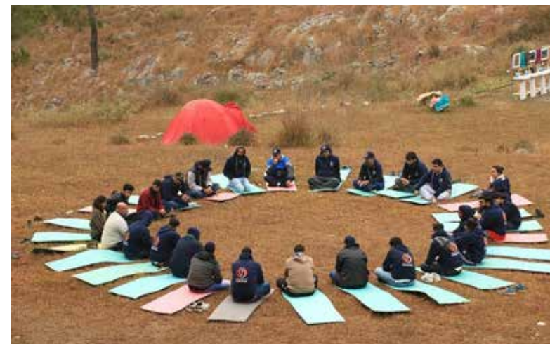
The yoga session was a personal favourite for many at the outbreak