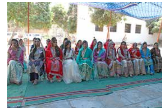
The beautician students took part in a bridal make-up contest