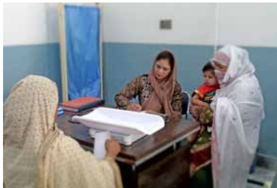
The clinic has been well received by the community and has already begun to benefit families and children with quality healthcare

This initiative has been well-received by the community, with many expressing their delight and gratitude to the Company. As a socially responsible Company, we look forward to continue making such community investments that positively impact the communities where we operate.