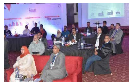
Over 40 healthcare professionals were invited to the conference