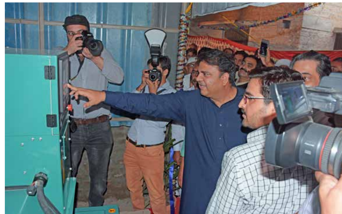
Information Minister, Fawad Chaudhry, was the Chief Guest on the occasion