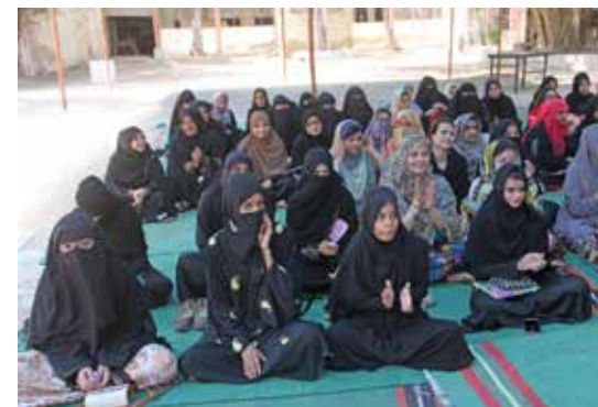
Students and their families thoroughly enjoyed the ceremony