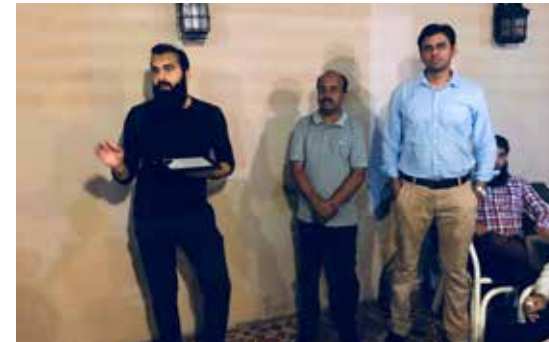
Opening session by HSE Manager