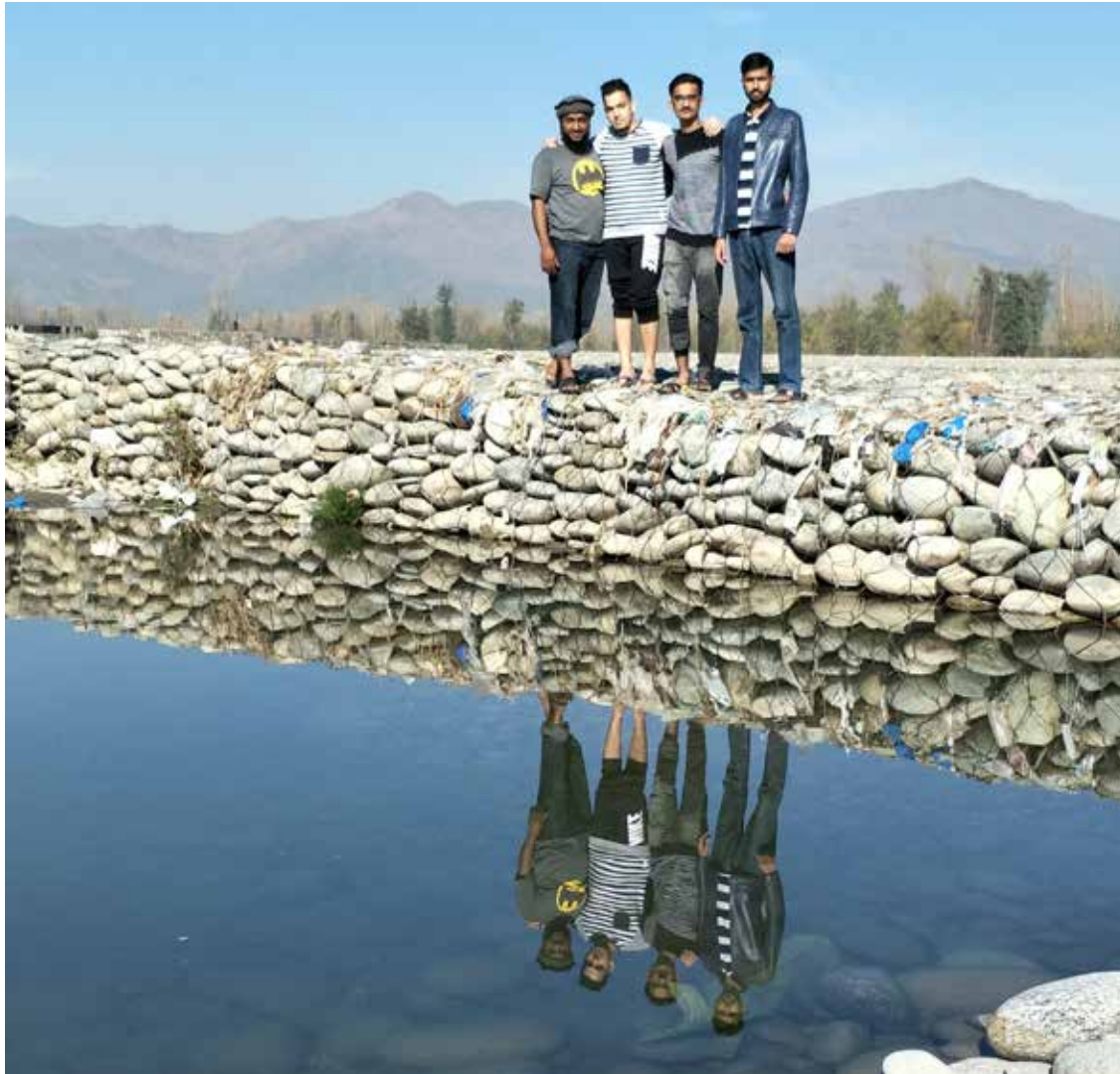
Reflection - Swat River