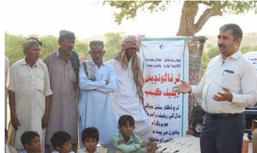
Team members from the Division highlight the importance of keeping livestock animals healthy