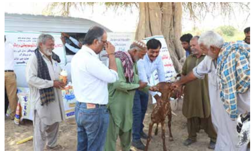
Medicines were administered to livestock after the opening session