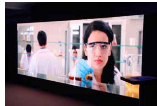
A shot from the corporate film which was screened live across the Company’s major locations