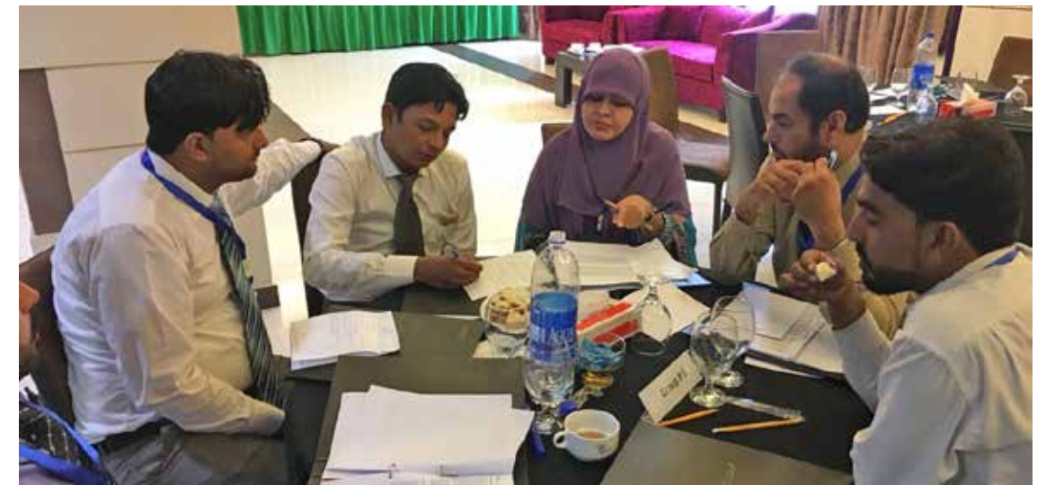
Participants engaged in a group activity at the Sales Effectiveness Training

Primarily, these trainings proved to be a huge success as they not only helped the Sales team learn about effective selling strategies, but also expanded their knowledge regarding the field in general.