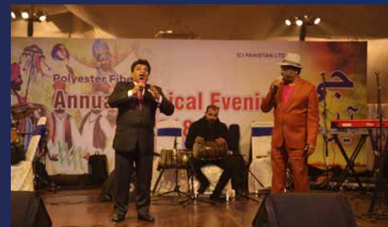
The comedians were a crowd favourite