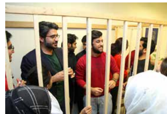
Jail and Bail: the most popular activity of the day