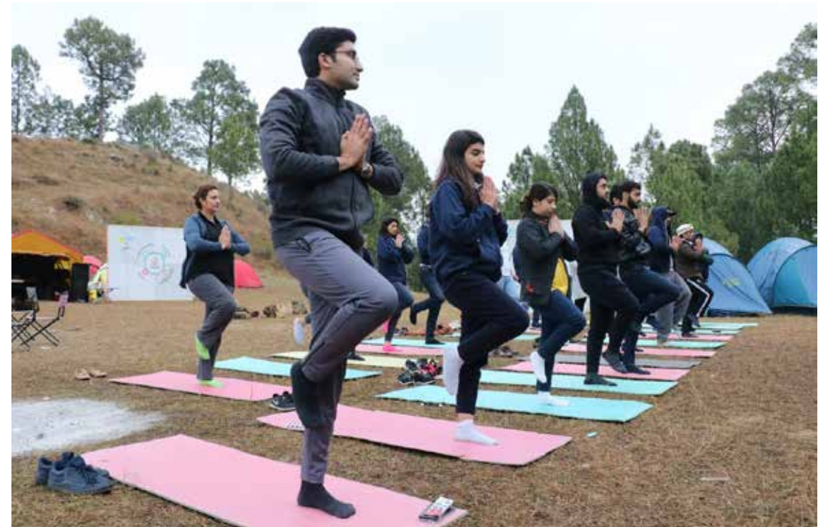
A revitalising yoga session was held in the morning