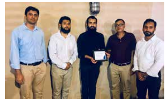
Certificate ceremony with the E&I team