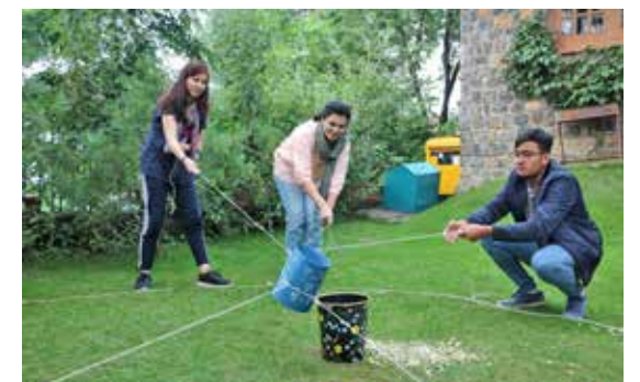
The GRs displayed true competitive spirit during the activities