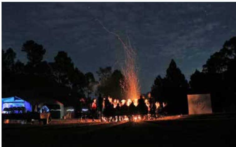
Team members gathered around a bonfire during the outbreak

experiences. These three days taught me a lot about myself that I could not have figured out otherwise. I am very thankful for this amazing initiative and I hope the friendships we made at Jabri would last forever.