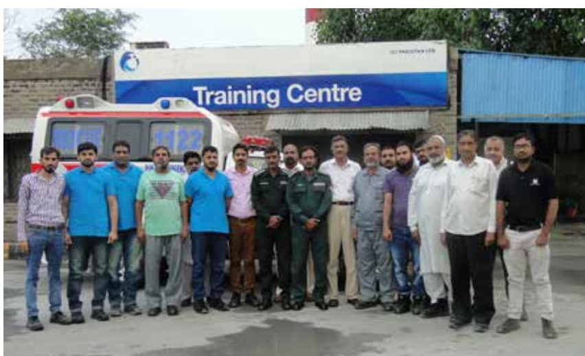
Group photo of fire-fighting training with 1122 Staff

In the end, it proved to be an interesting and informative experience that helped the team appreciate the importance of teamwork in dealing with a fire emergency.