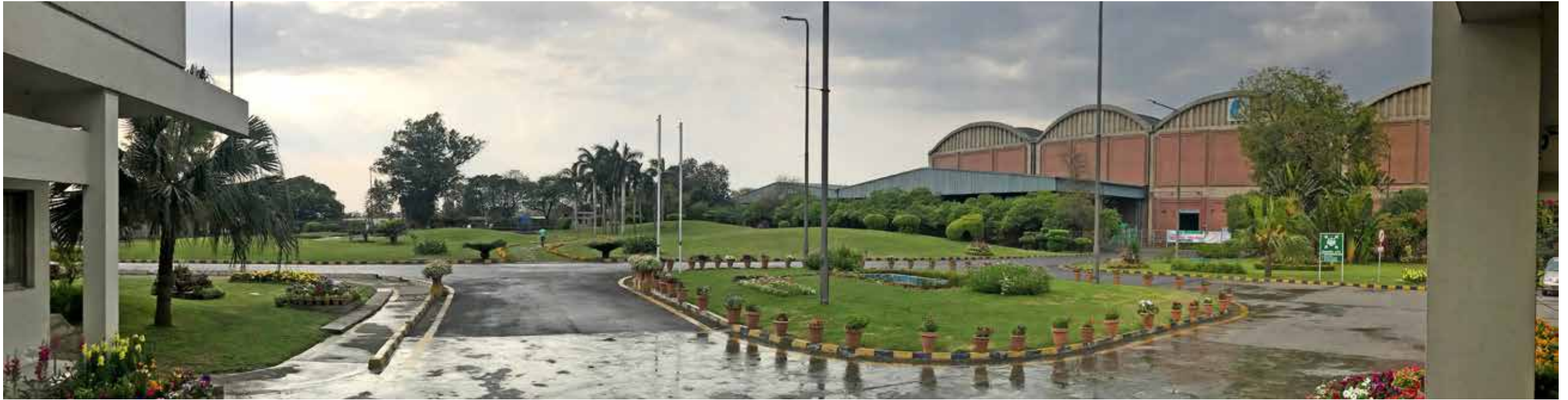
Rain Relief - ICI Pakistan Limited Sheikhupura site.