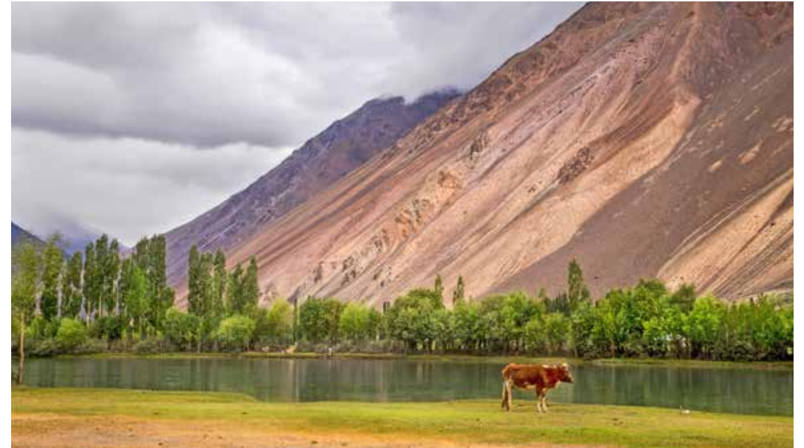
Tranquility - Phander Valley, Ghizer, Galgit Baltistan