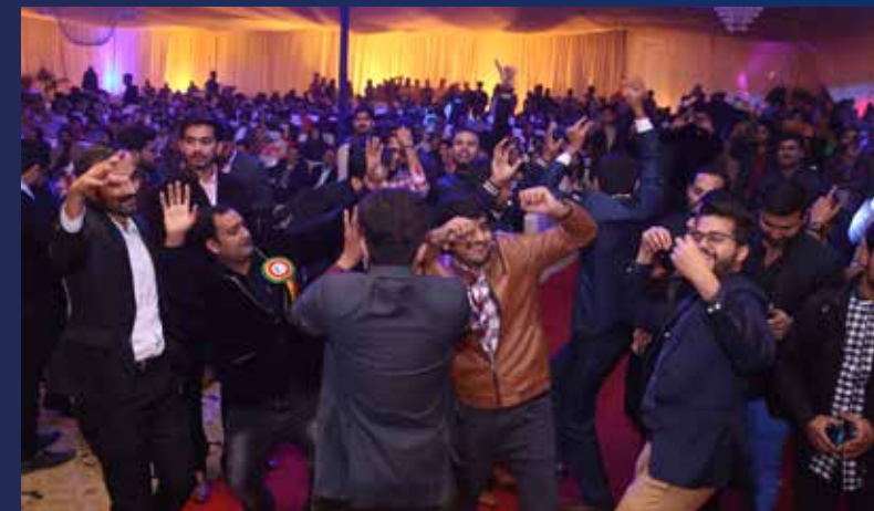
The audience danced and thoroughly enjoyed the musical performance