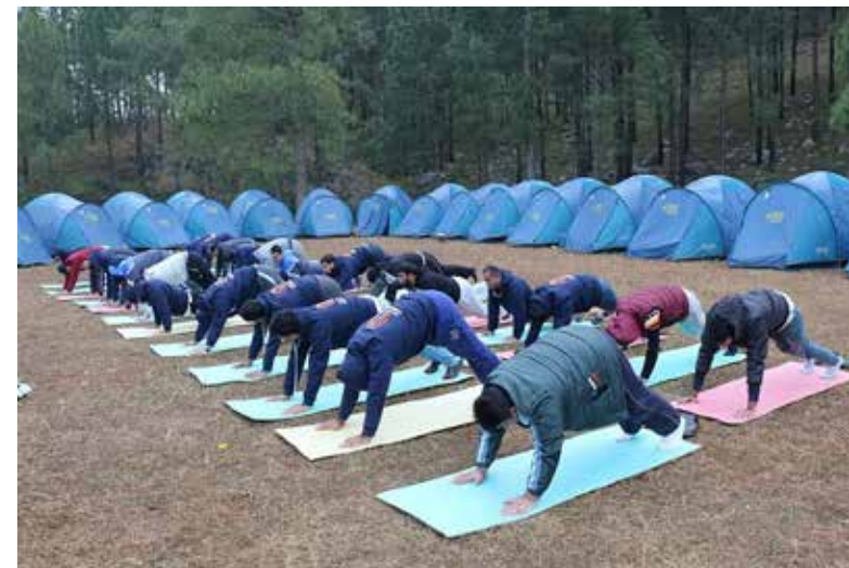
The yoga routine posed a challenge at times, but it was all in good fun