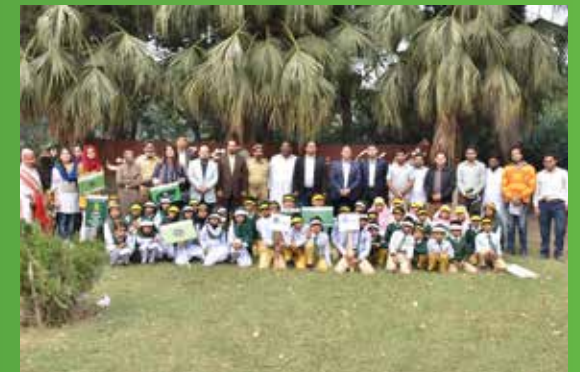
Group photo: Pehchan volunteers at Urban Forest, Karachi (left) and Sheikhupura (right) after the tree plantation