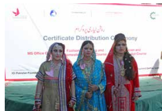
The top three winners of the contest Photograph: CCPA Team