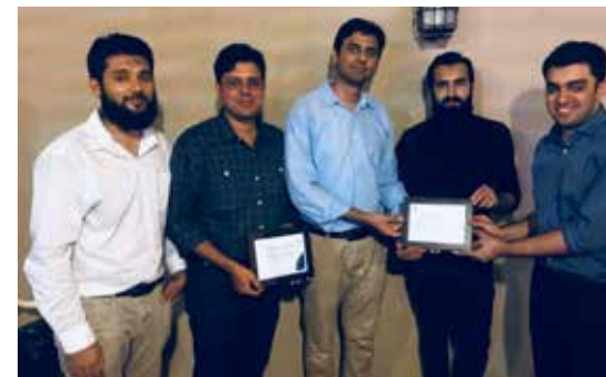
Certificate ceremony with the Marketing team