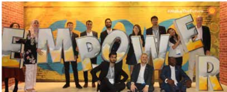
The summit was an excellent opportunity to network and engage in fun activities

building a better world through economic development and poverty alleviation, improving education, preventing treatable diseases, human rights and environmental sustainability.