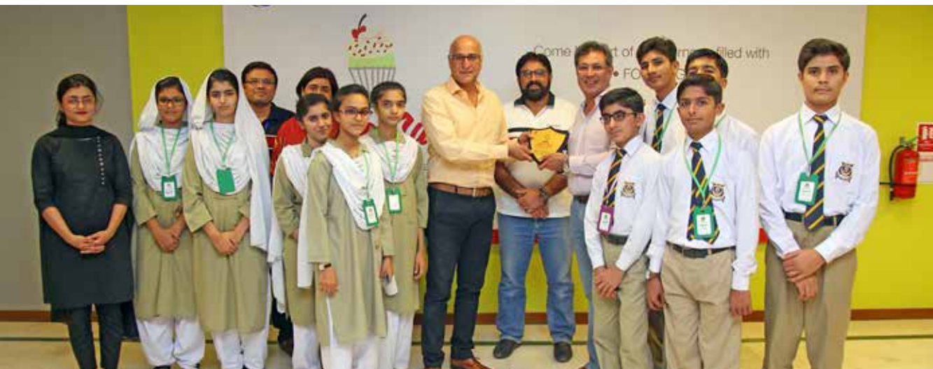
Chemicals & Agri Sciences generated the highest contribution towards the charity