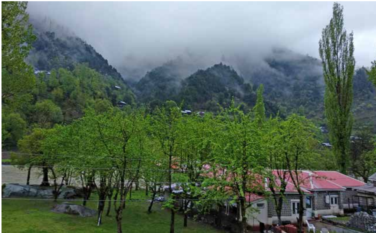
Rolling Clouds - Karan, Neelam Valley, Kashmir