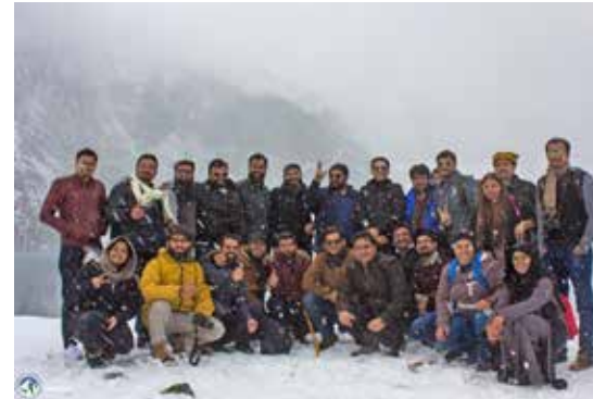
The Team at Ratti Gali Lake