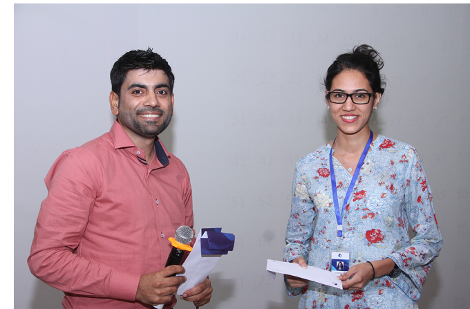
Prizes were handed out after the activity Chemicals & Agri Sciences Team