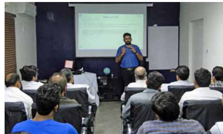
Training on Emergency Response Procedures