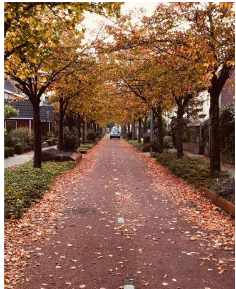
A picturesque shot of the Hague

It is up to my generation and future generations to save our planet, create a more peaceful society, and put an end to poverty. Ultimately, it is easy to talk about changing the world and making a positive impact, everyone wants to do it. In reality, actually doing it is not easy. But remember, if not you, then who? If not now, then when?