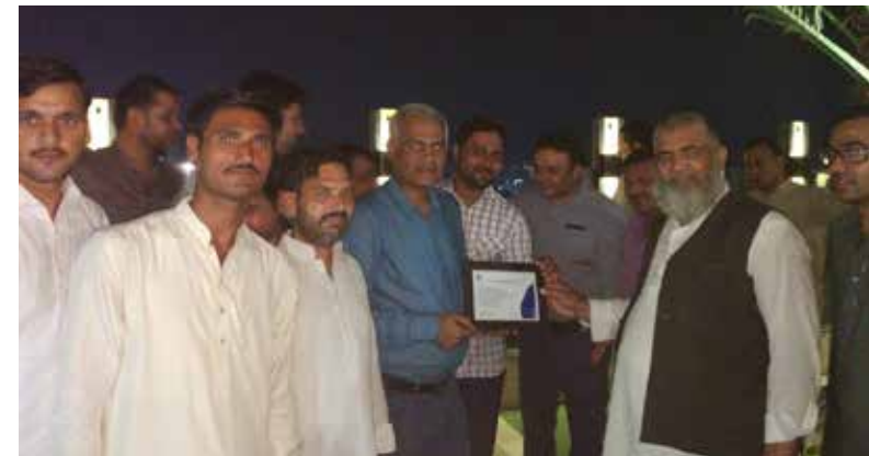
Fibres Group-D Draw lines team receiving certificate of appreciation