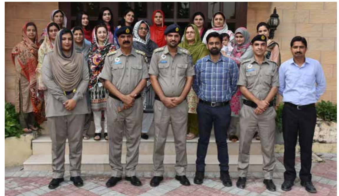
Group photo: Motorway Police held a training session with the community ladies

As part of our goal to ensure sustainable business operations, we place great emphasis on the principles of health and safety for all stakeholders. We accomplish this by regularly carrying out trainings and workshops to keep our employees updated about our HSE policy and standards.