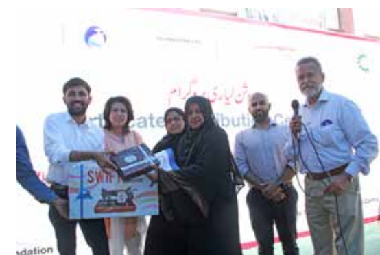
Gift and certificates were handed out during the ceremony