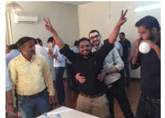
Our Polyester team at Sheikhupura celebrated the launch of the EXPLORE Challenge with some fun and games

We plan to launch various other initiatives under the EXPLORE umbrella in the coming months, so stay tuned for more updates.