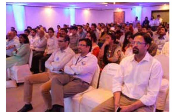
Colleagues from our Head Office in attendance at the launch event