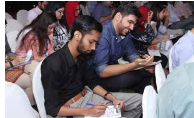
The Tambola activity drew in plenty of participants Chemicals & Agri Sciences Team

We hope to see more of such activities in future as well as they reflect ICI Pakistan Limited's commitment towards a 'people first' culture and bring people across Businesses together.