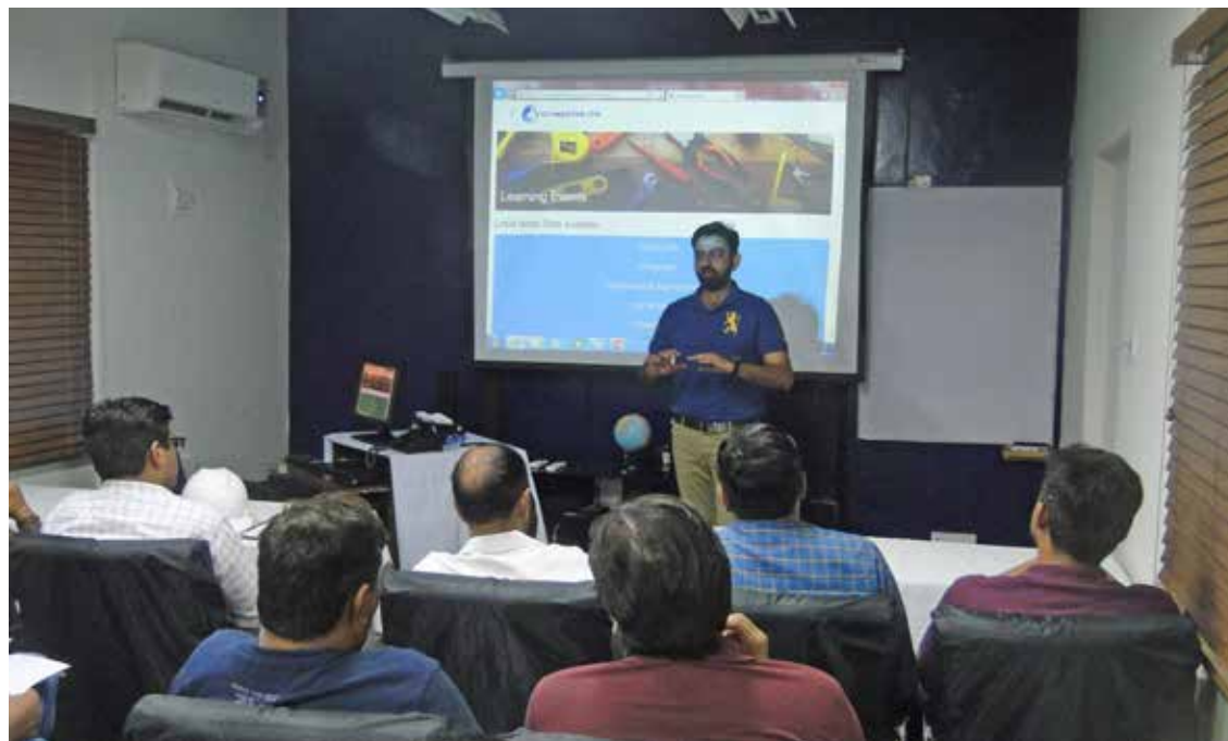
Training on Learning Event Database Management System

This session included the understanding of sirens and its types, evacuation drill and responsibilities of the Emergency Coordination Committee, and Safety Manager.