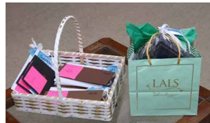
A glimpse of some of the prizes Chemicals & Agri Sciences Team