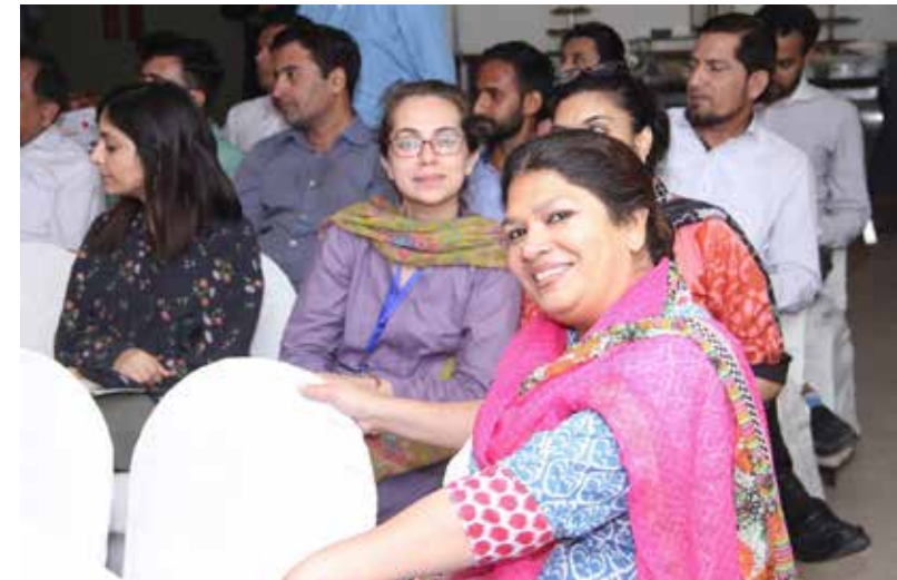
The session's participants left with renewed optimism and increased motivation