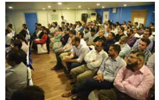
Colleagues at our Lahore office listen intently