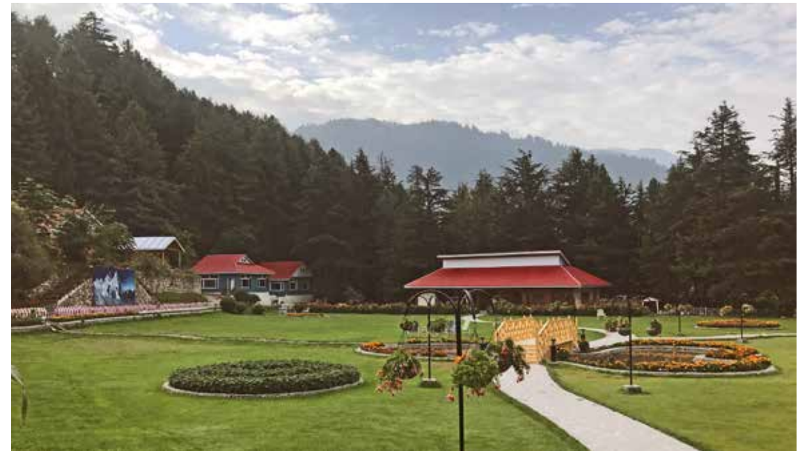
Green Dreams and Blue Skies - Shogran