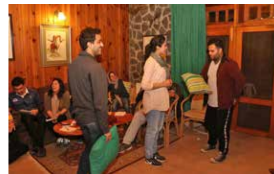
One of the many team building exercises conducted during the day