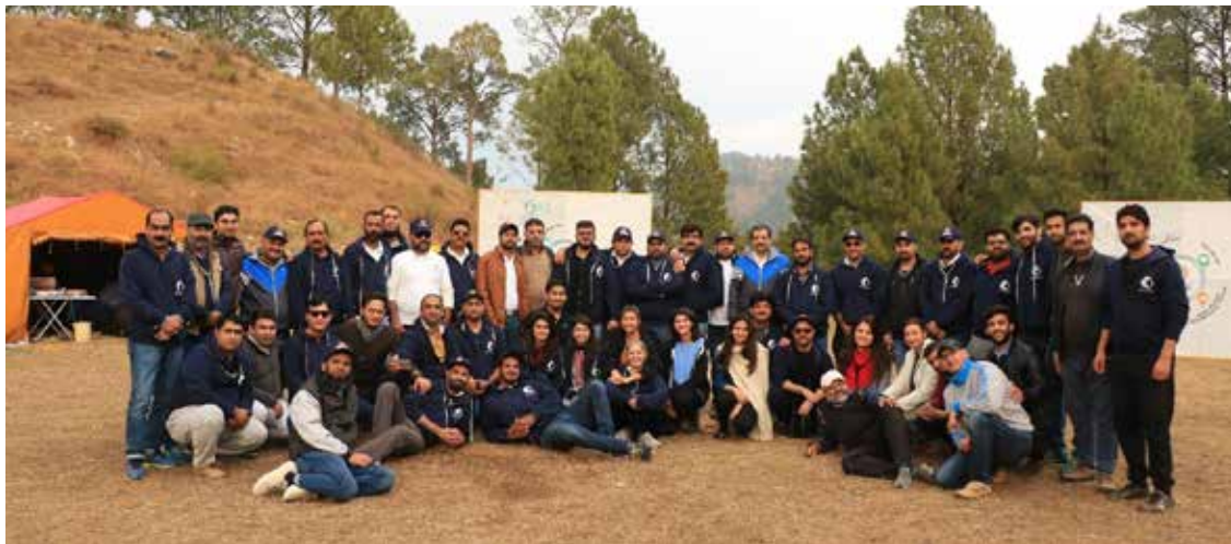
Team members pose for a picture before the day-long hike

The Chemicals & Agri Sciences Business went out on a team outbreak, this is the story recreated through the lens of one of its team members.