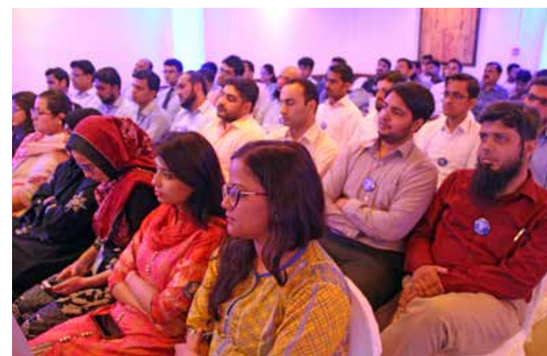
A glimpse of the audience during the event