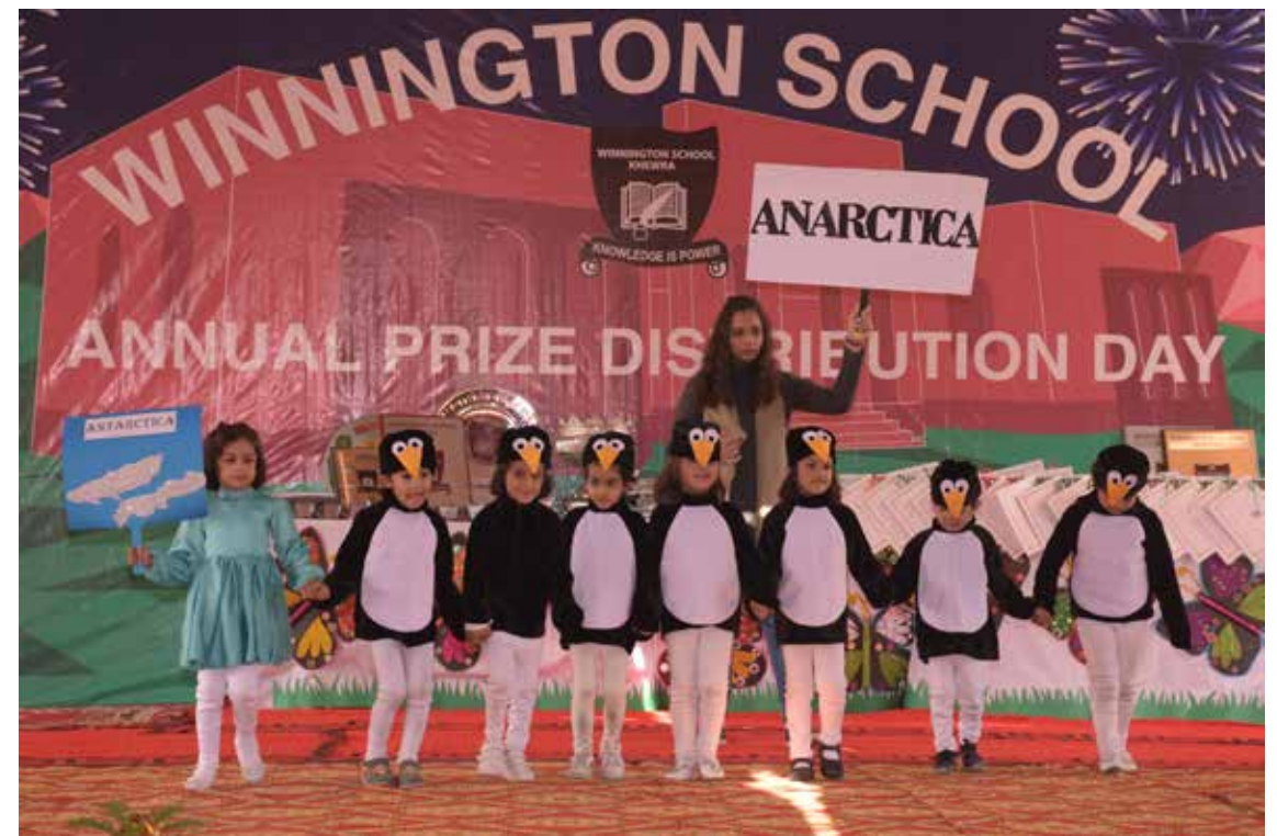
All the presentations and plays were greatly appreciated by the audience