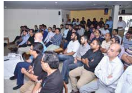
Audience at our Sheikhupura site during the launch event

The EXPLORE Challenge has received a phenomenal response from the entire organisation as over 200 ideas, relating to new business development, start-up and mobile applications, and improvements in internal processes and systems, have been submitted.