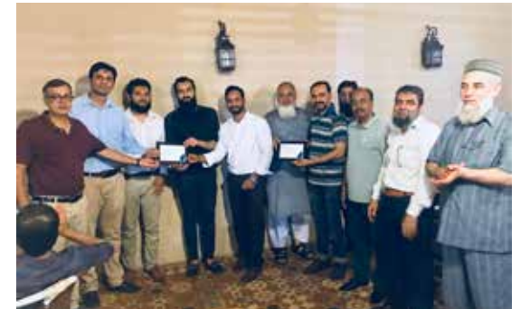
Certificate ceremony with the Technical & Production team