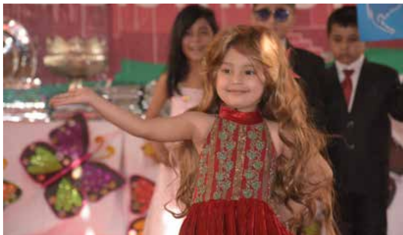
Students from pre-school performed a play in which they dressed as famous personalities from around the world

The Chief Guest was then invited for the ceremony's closing remarks. In his address, he praised the high quality of presentations and congratulated the Principal and staff on hosting a well-organised ceremony. He congratulated all parents and reiterated ICI Pakistan Limited's commitment to support the school so that it would continue its mission to empower the youth of the area through quality education.