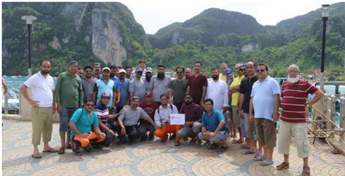
The Division's Livestock team posing with the dealers for a group photo