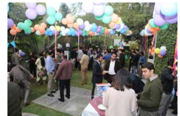
Bake Sale arrangements at the Mozang Lahore office