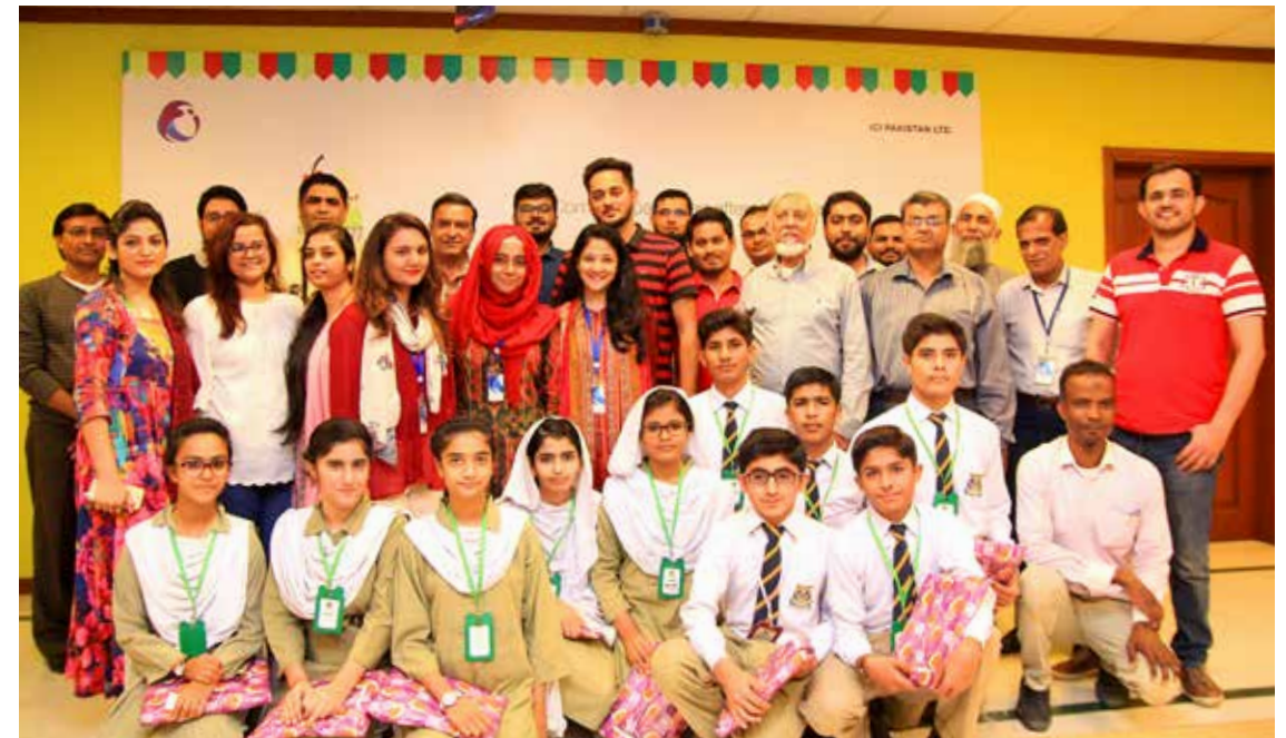
Group photo of children from the NJV along with some of our colleagues

With the continued support of all employees, we hope to make this event bigger and better each year!