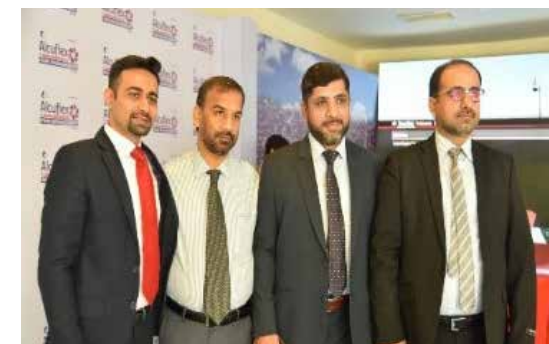
Team members pose for a picture