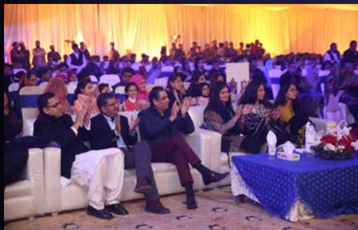
The event was widely attended by the Polyester team and their families