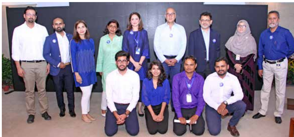
The Pehchan launch team poses for a photograph

The name Pehchan comes from the Urdu word 'Pehchan', which has a layered meaning. It fits perfectly with the initiative as, in one context, it means identity, while in the other it is about recognition. By volunteering their time for a good cause, our people are establishing their identity as a caring and responsible citizen. They are also representing the Company as a brand ambassador, and helping to uplift our brand image as a responsible corporate entity committed to giving back to the society. In essence, they become our Pehchan!